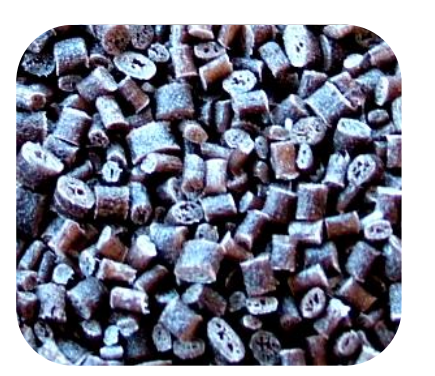
Figure 2. Lignin reinforced PLA composites