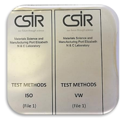
Figure 4. Xylan-alginate samples containing clay nanofillers