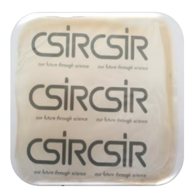
Figure 3. Xylan-alginate samples